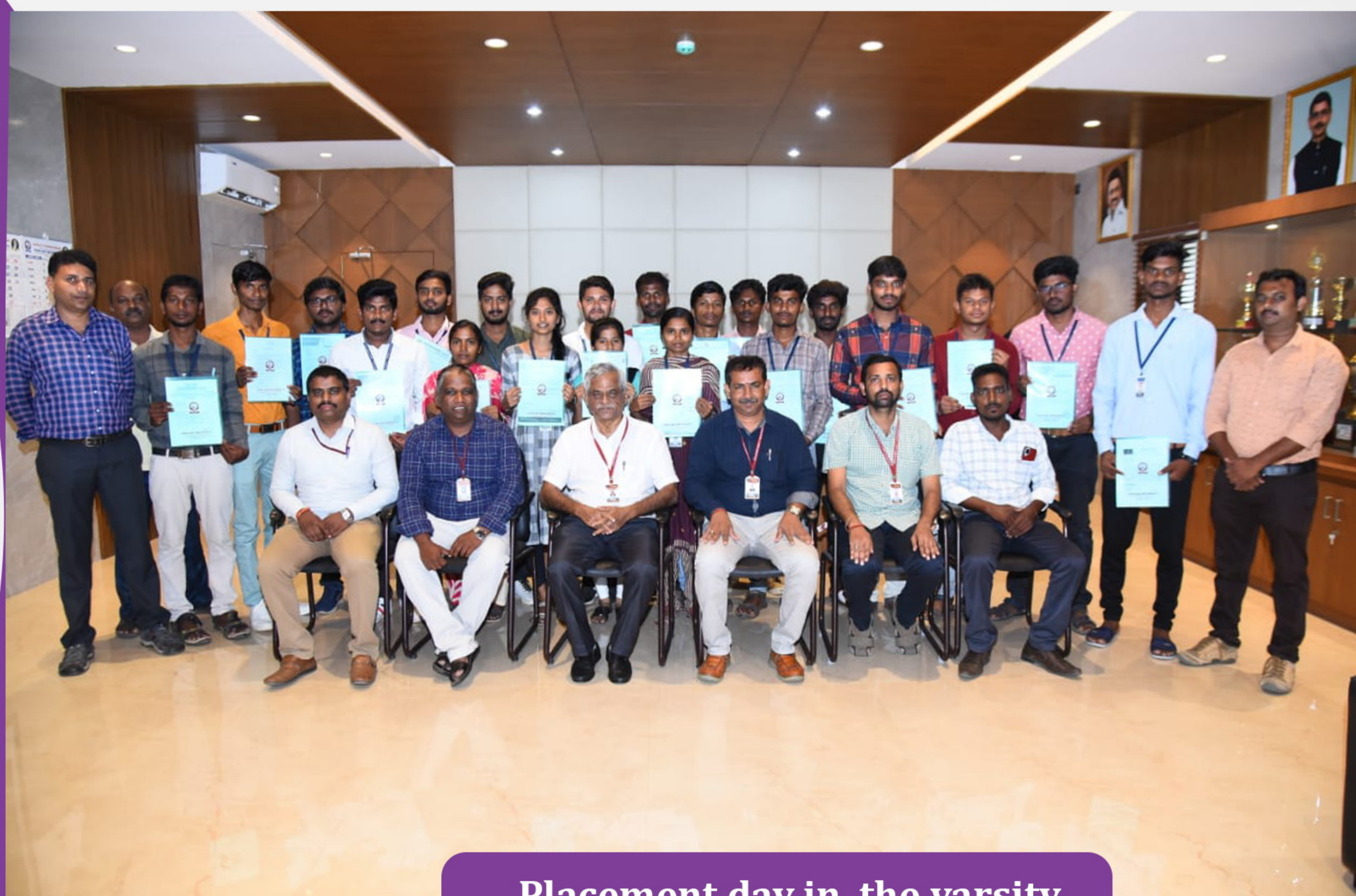
Placement day in the varsity