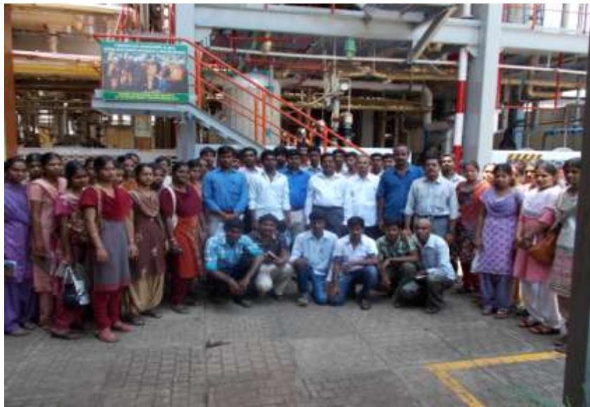
Industrial visit at Sakthi Sugars PVT limited, Appakkudal, Erode