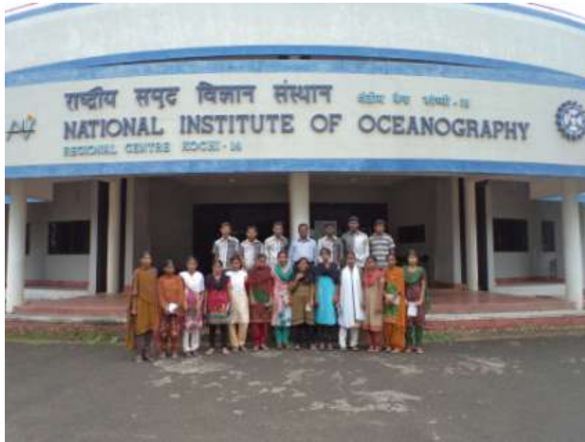
Industrial visit at National Institute of Oceanography, Kerala