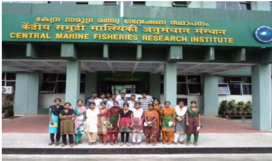
Industrial visit at Central Marine Fisheries Research Institute, Kerala