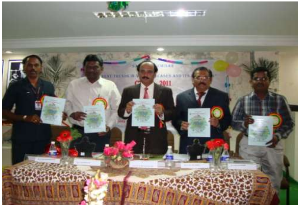
National Seminar on “current Trends in Viral Diseases and its Diagnosis” (CTVD-2011) Dr. held on 3rd-4th March 2011