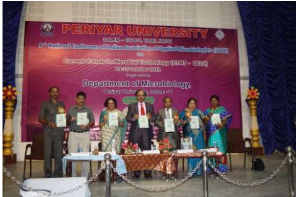
9th National Conference of Indian Association of Applied Microbiologists on the topic “Current Trends in Microbial Technology” Held on 14th-15th October 2011