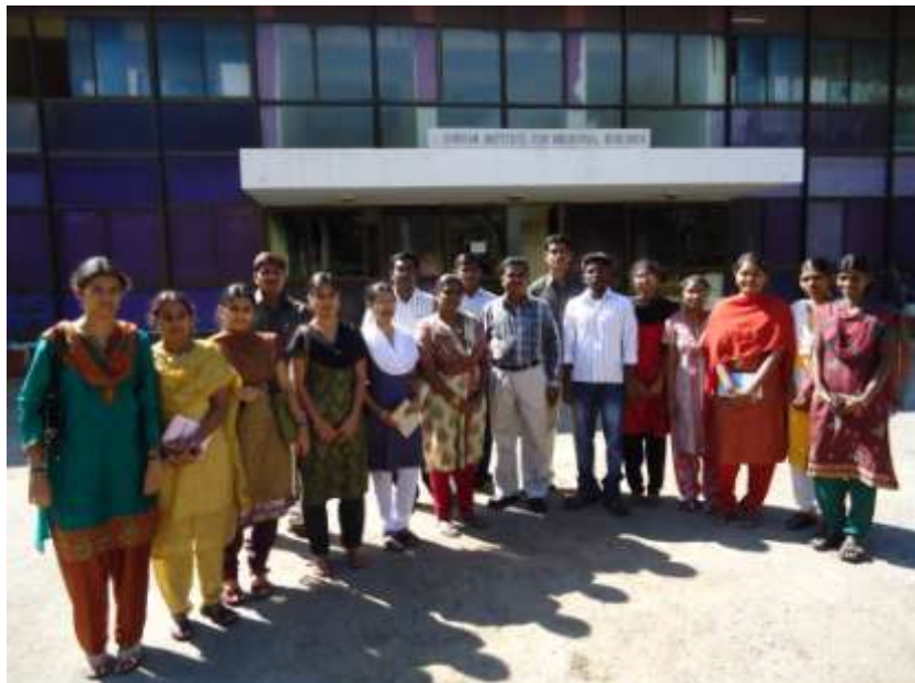
Industrial visit at Sri Ram Institute for Industrial Research, Bangalore