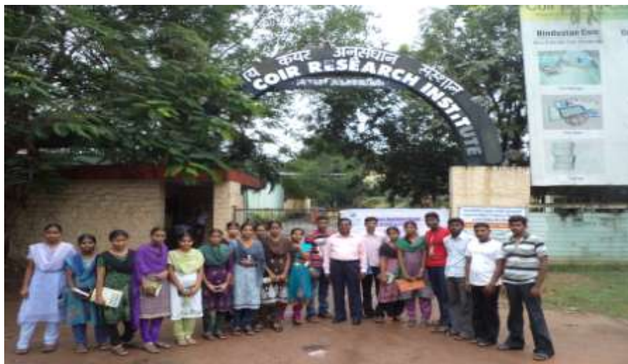
Industrial visit at Coir Research Institute, Kerala