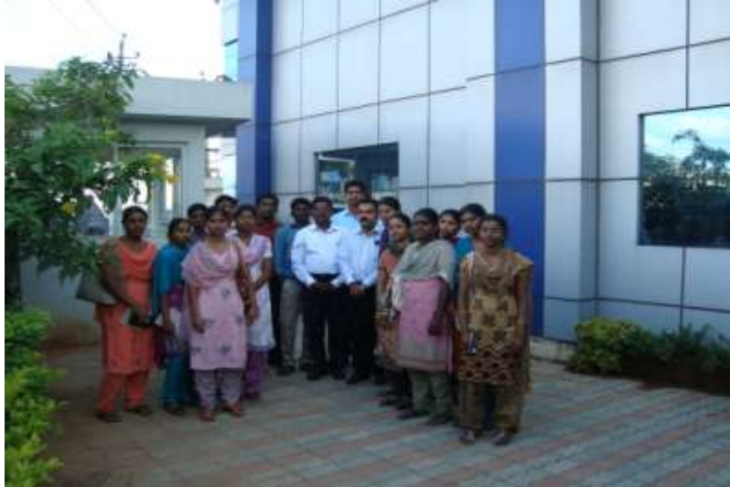
Industrial visit at Green chem, Bangalore