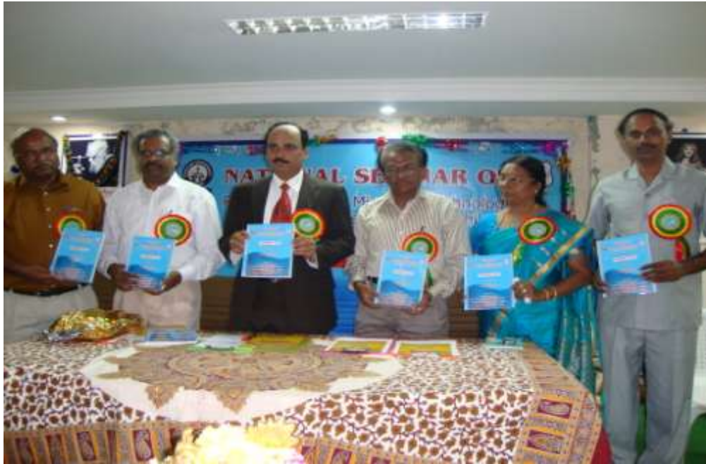
National Seminar on “Recent trends in Microbial Technology with reference to Extremophiles” (Extremos 2010) held on 21st-22nd October 2010