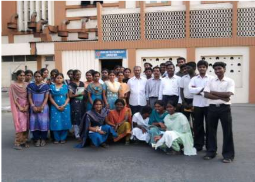
Industrial visit at Sakthi Sugars PVT limited, Appakkudal, Erode