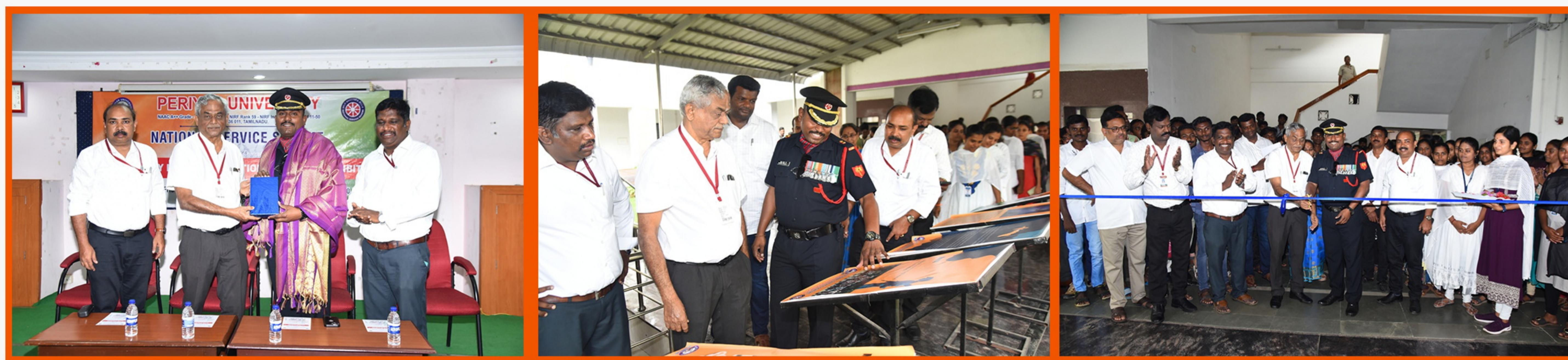
Kargil Vijay Diwas celebration and Photo Exhibition organised by National Service Scheme, Periyar University on 26.07.2024